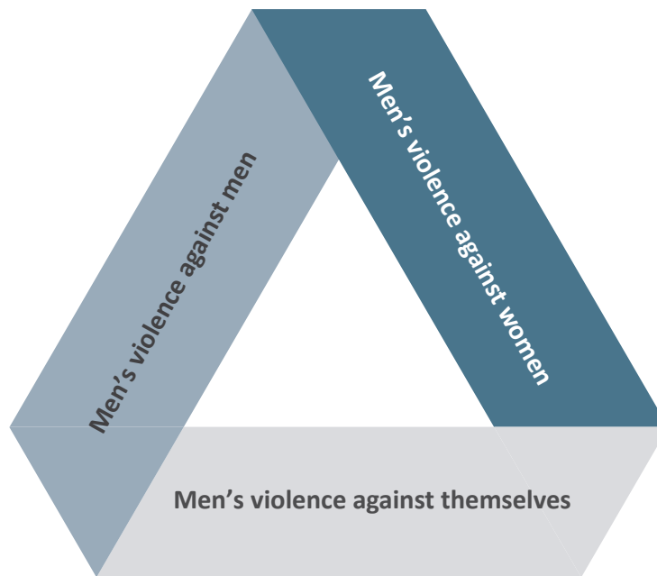
Figure 3: Triad of men's violence

Source: Kaufman, M (1987) The Construction of Masculinity and the Triad of Men's Violence , in Kaufman, M (Ed), Beyond patriarchy: essays by men on pleasure, power and change , Toronto: Oxford University Press